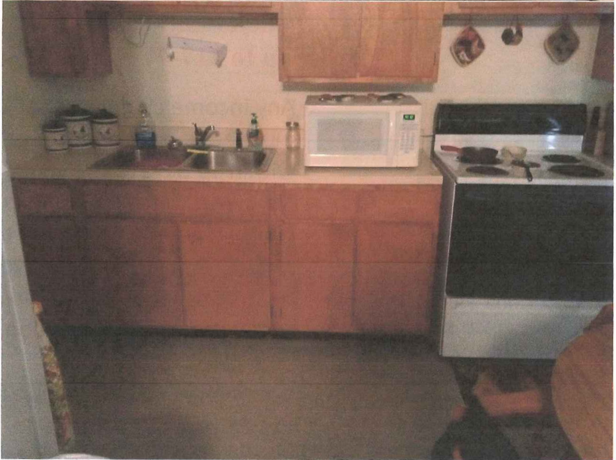
The top photo shows how you do not want your kitchen to look like. The bottom photo is what your kitchen should look like.