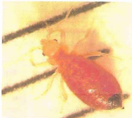
Bed bug nymph after feeding