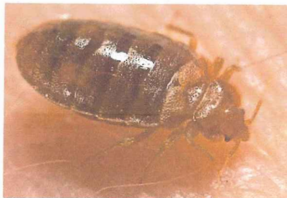
Adult bed bug